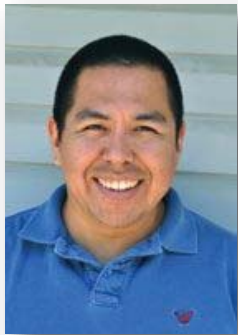
Huy ch q'u Siem,

For more information on the Centre or the event, please visit our website at malahatnation.ca or contact a member of our team at 250.743.3231.